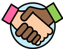
Step 1: Meet & Greet

All performers are required to attend a dance audition and acting/singing audition. All performers with a disability are also required to book a meet and greet.