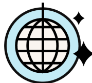
Step 2: Dance